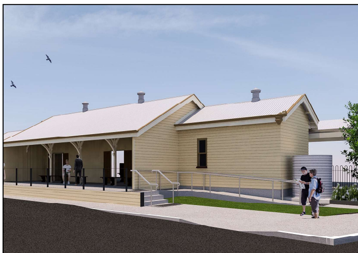
Artist's impression of Shorncliffe historic station building restoration

Queensland Rail is committed to keeping stakeholders and the community informed about this project. For more information, please call 13 16 17 between 7.15am and 5pm Monday to Friday or email communityengagement@qr.com.au