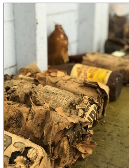
1950s artefacts discovered at Shorncliffe train station

For further information, please contact 13 16 17 or email communityengagement@qr.com.au