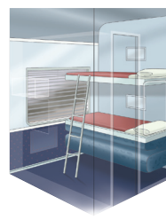
Twin sleeping berth night