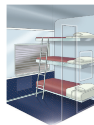
Triple sleeping berth night