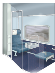
Single sleeping berth day

Single sleeping berths consist of a single bed for one customer, or one adult sharing with a child under four years. Each cabin contains a wardrobe, power point (240 volt AC) and a washbasin with vanity mirror. The berth has a reading light, pillow, top and bottom sheet, blanket and towel. Half of the single sleeping berths face in the direction of travel and the other half in reverse. Meals are inclusive for customers travelling in Single sleeping berths and they have exclusive access to the Restaurant car and Lounge car.