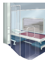
Single sleeping berth night