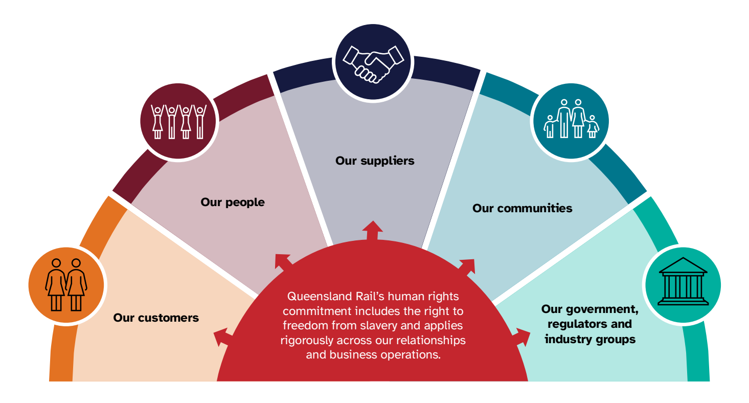
Figure 1. Our stakeholders and commitment to human rights

We understand how our business activities impact human rights, and where risks of modern slavery may be present in our operations and supply chains. Our operations and supply chains are complex and involve a diverse range of stakeholders.