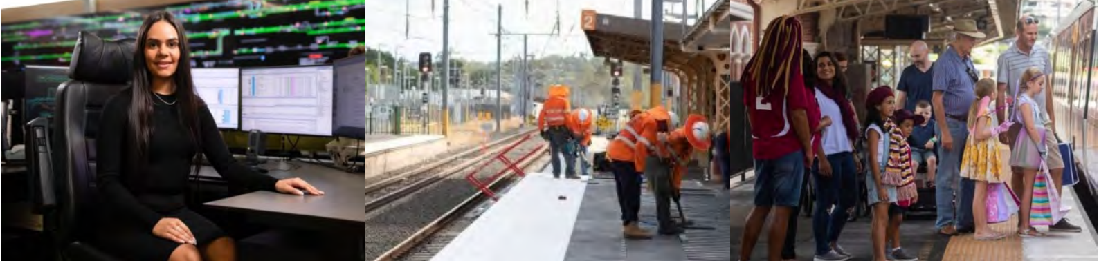
Figure 2. Our values