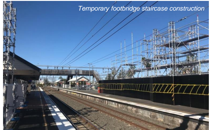
Temporary footbridge staircase construction

The ramp to platform 2/3 (at South Pine Road level crossing) will be closed for construction from Monday 17 September. Please see station staff if you require assistance accessing the station or boarding services.