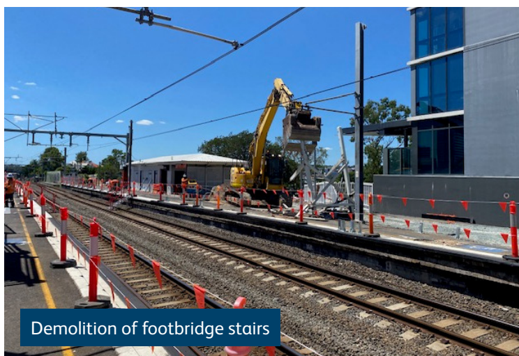
Demolition of footbridge stairs