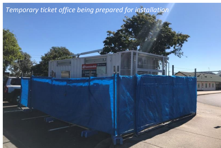
Temporary ticket office being prepared for installation