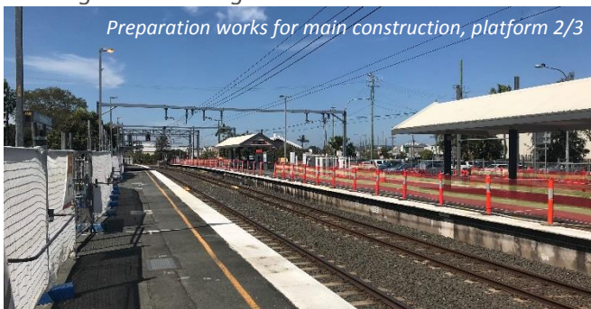
Preparation works for main construction, platform 2/3