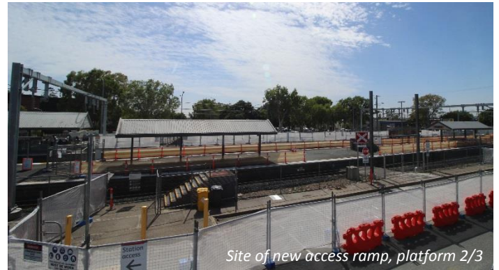
Site of new access ramp, platform 2/3