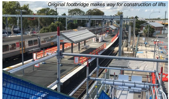
Original footbridge makes way for construction of lifts