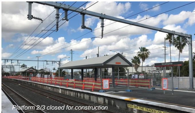
Platform 2/3 closed for construction