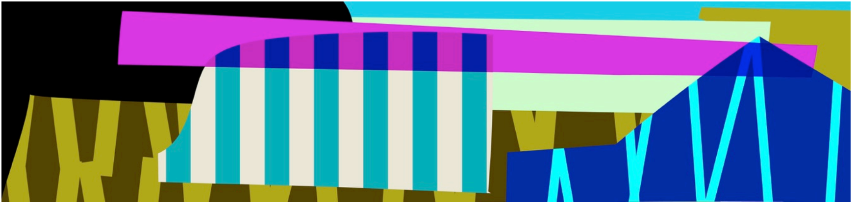
Simon Degroot, 'Building Pattern Form' 2017

My mural 'Building Pattern Form' is closely related to the local area of the Barracks Complex and is designed to complement the existing public art and architecture in the area. Inspired by colours and forms that feature in local buildings, my design highlights particular architectural shapes and patterns. I have looked to the historical architectural forms of the buildings, the colours of street furniture on the pedestrian overpass, and to landscaping details in the Barracks complex such as trellises. I have also incorporated directional lines and visual movement in this work because this is a unique feature of the revitalised Barracks Centre where a series of lanes – based on the original plans – connects pedestrians with surrounding vibrant cultural hubs.