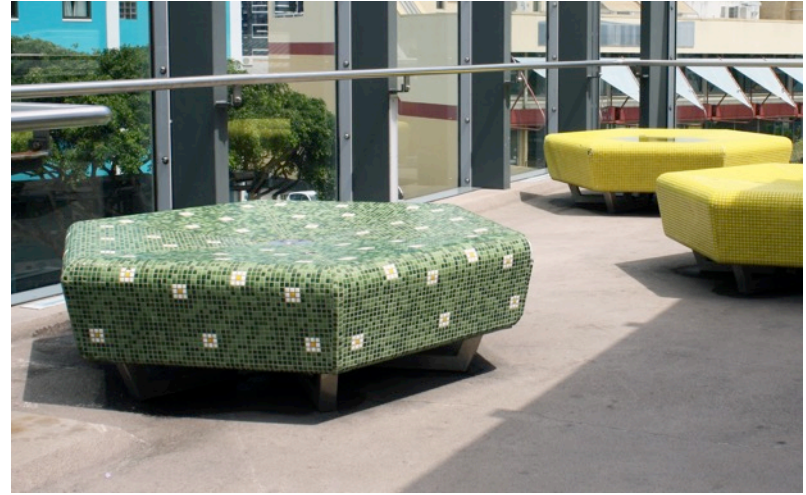
Roma Street and Barracks Complex local public art and design

The Barracks Complex is just a short walk from the Roma Street Transit Centre. The Barracks North Wall artwork site is located in close proximity to other public art and urban design. For example, Nikolaus Seffrin's Fountain in E.E McCormick Park, the linear brick pattern of the Roma Street Fire Station, and The Siren Wall designed by Inkahoots are clearly visible as pedestrians walk towards the Barracks, Caxton Street, or Suncorp Stadium. This artwork is designed to be viewed quickly from the train and features a series of large shapes to be viewed by 90,000 rail customers each day. These features engage passengers in a kind of visual movement as they travel past on the train, and are also designed to activate the limited viewpoints as pedestrians walk past using the overpass above.