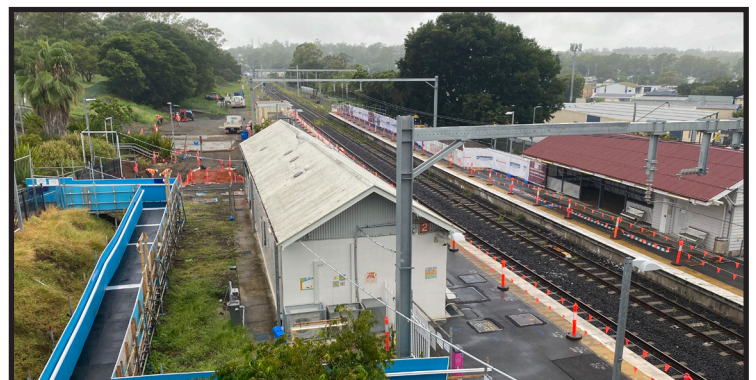
Platform, building, footbridge and lifts works area