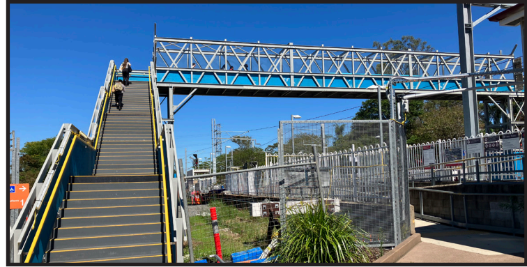
The new temporary footbridge (above) remains open

Please follow traffic control signs and directions.